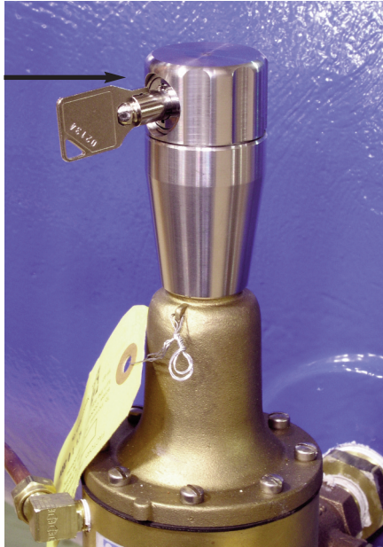
X140-1 Locking Security Cap