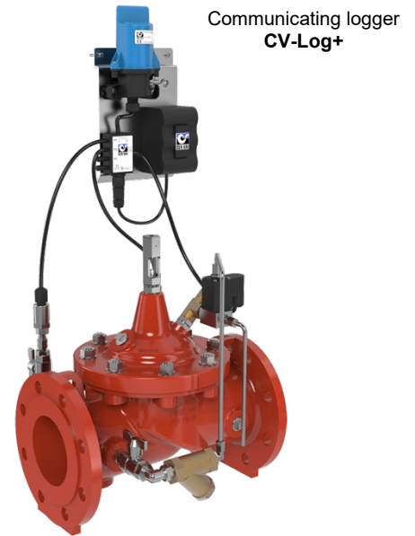
Communicating logger CV-Log+