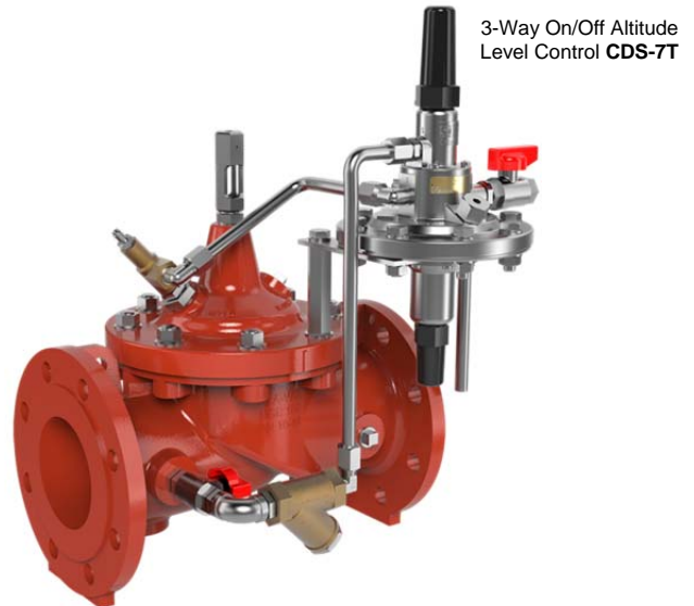
3-Way On/Off Altitude Level Control CDS-7T

The CLA-VAL SERIES 270 On/Off Altitude Level Control Valve controls the high water level in a reservoir or closed tank without the need for floats or other devices. It is a non-throttling valve that remains fully open until the shut-off point is reached.